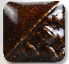
SW-178 Fool's Gold