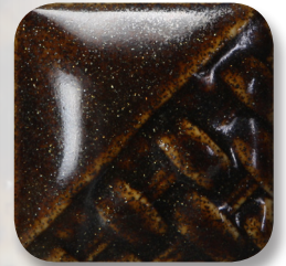
SW-178 Fool's Gold